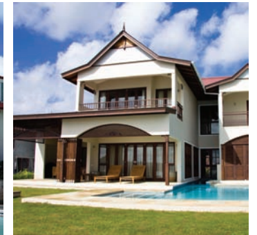
What has been delivered