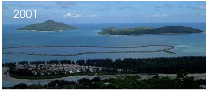
The creation of Eden Island begins