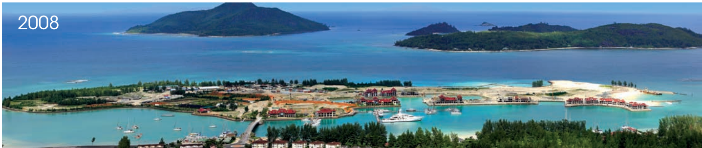
First homes already completed and the marina takes its first vessels