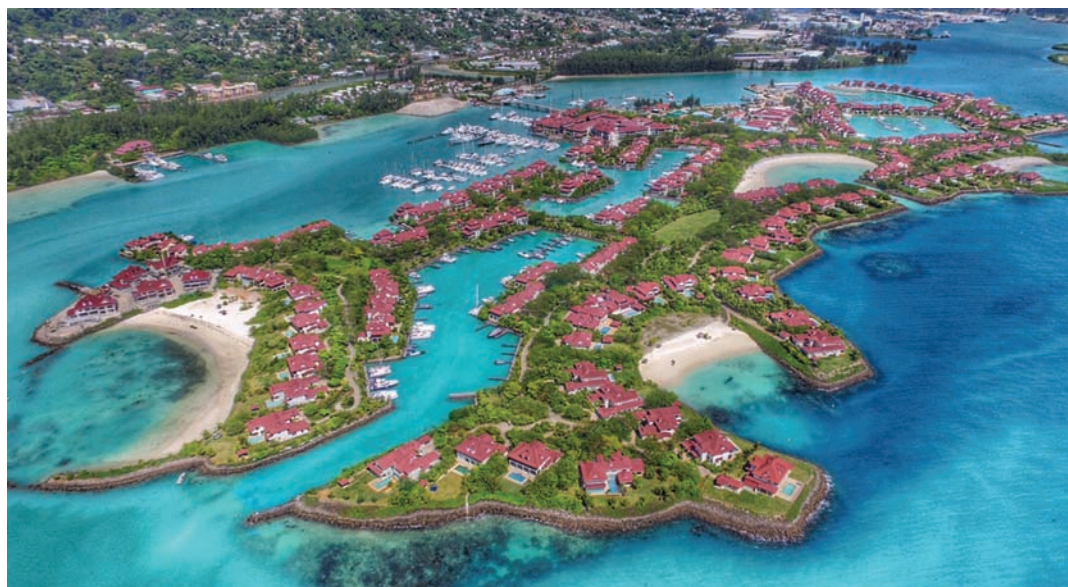
Aerial view over the villas on Anse Tec Tec and Anse Bernitier