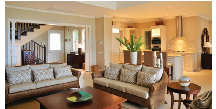
A full range of furniture selections is available to be bought with each home purchased