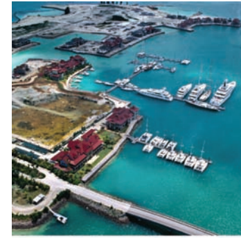
The development of the commercial precinct with Eden Plaza and Eden Bleu Hotel