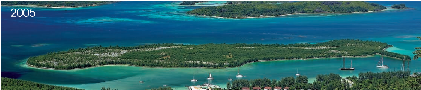
The 'green island' – as Eden Island looked when it was first introduced to the world market