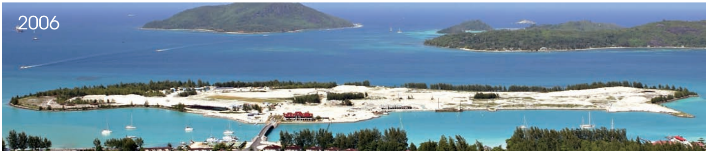
Eden Bridge and Eden House opened on 24 August 2006