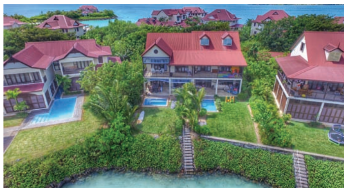
Spacious maisons right on the waters edge with their own private pools

Whether it is one of the magnificent Villas or the spacious Maisons or luxurious Apartments Eden Island has a broad range of freehold title homes to suit all tastes...all situated on the waters edge. It really is the time to take a serious look at this investment opportunity before the last of the few remaining new development units are sold out.