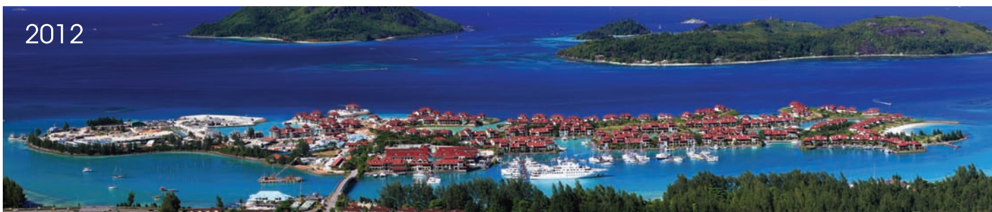
Phase 1 substantially completed and Phase 2 work begins