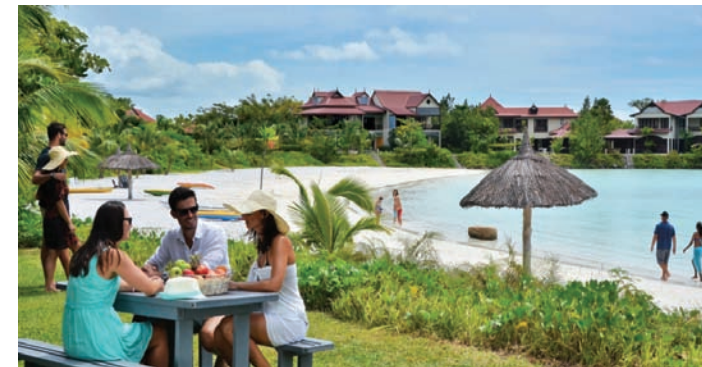
There are some stunning picnic spots on Anse Bernik

Whether it is one of the magnificent Villas or the spacious Maisons or luxurious Apartments Eden Island has a broad range of freehold title homes to suit all tastes...all situated on the waters edge. It really is the time to take a serious look at this investment opportunity before the last of the few remaining new development units are sold out.