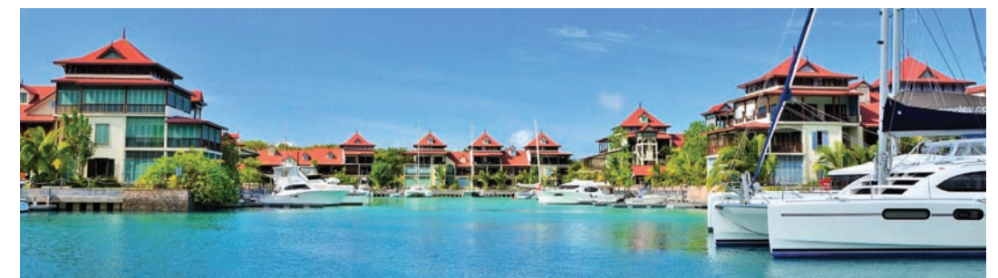
Each home comes with its own mooring right in front or close by