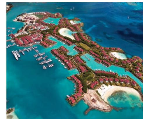
Aerial views over Anse Tec Tec beach taken in 2008 and more recently showing the transformation of the island